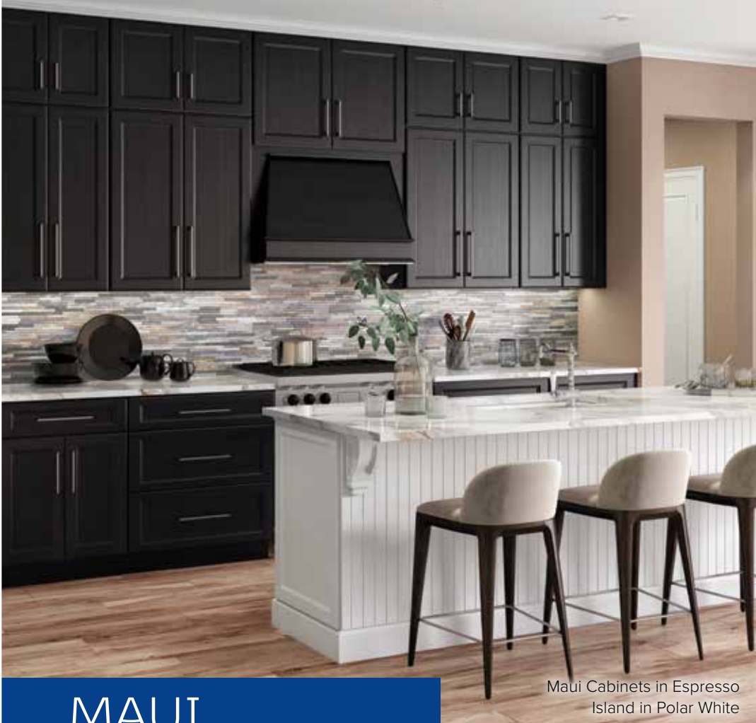
Maui Cabinets in Espresso Island in Polar White