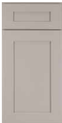
Pebble Grey (Painted)