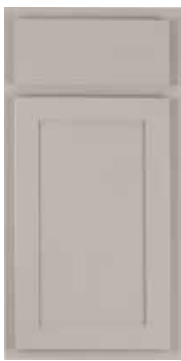
Pebble Grey (Painted)