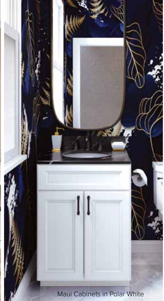
Maui Cabinets in Polar White