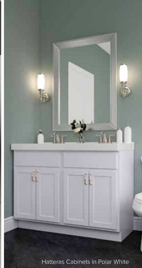
Hatteras Cabinets in Polar White