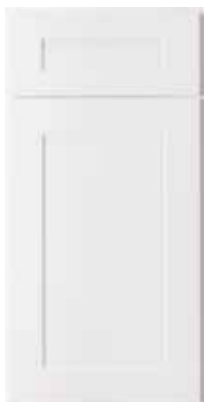
Polar White (Painted)