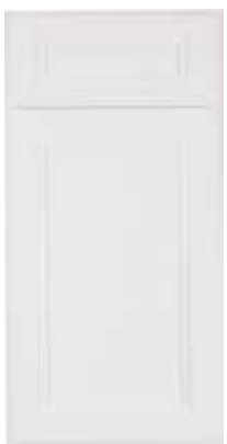
Polar White (Painted)