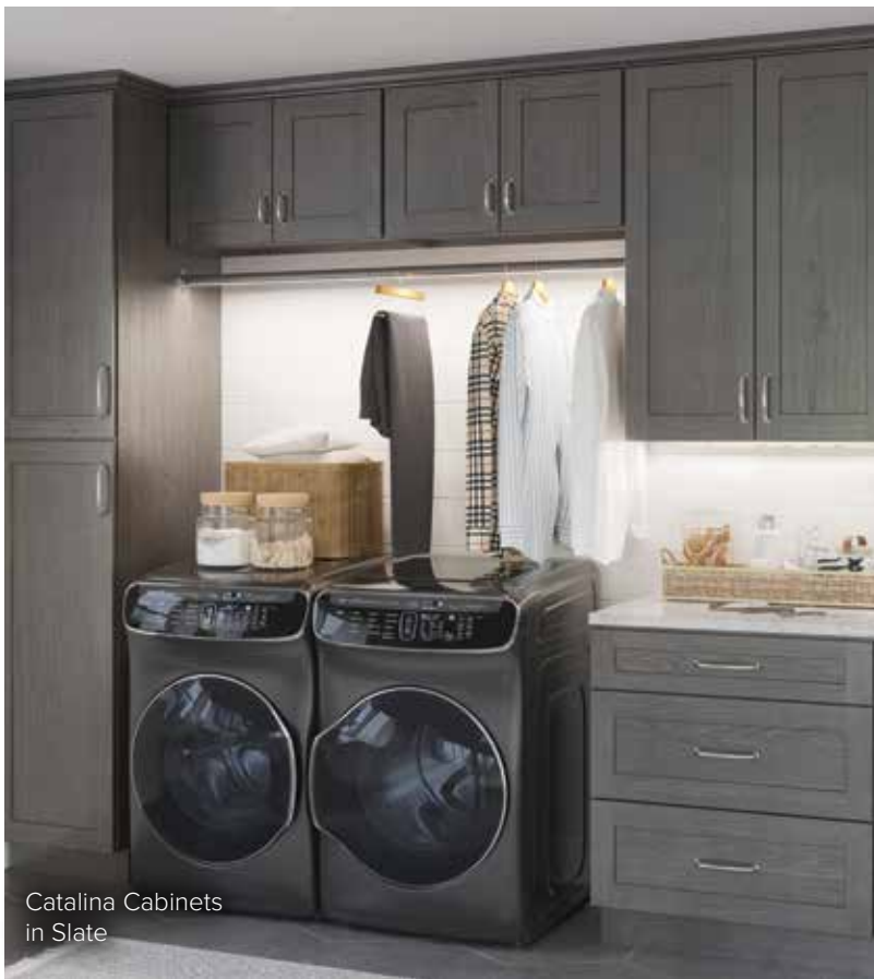
Catalina Cabinets in Slate