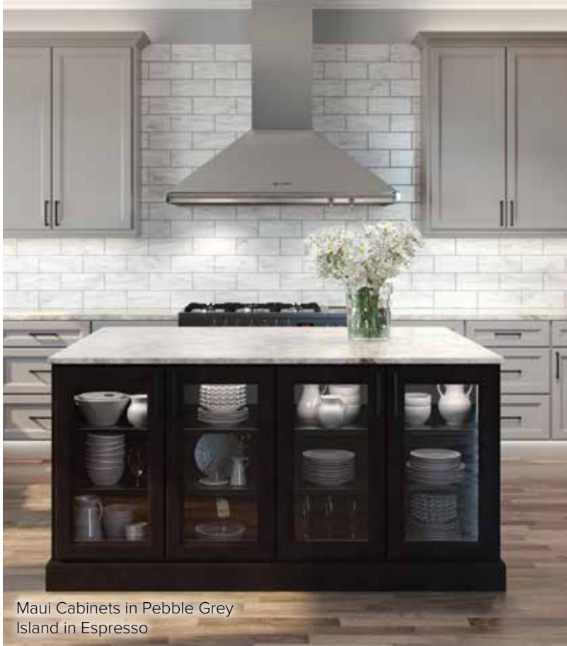
Maui Cabinets in Pebble Grey Island in Espresso