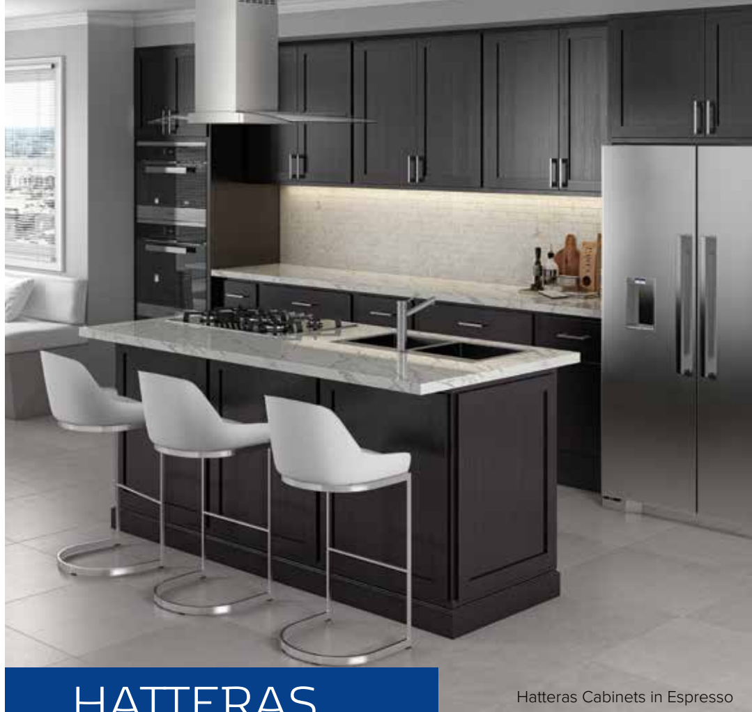
Hatteras Cabinets in Espresso