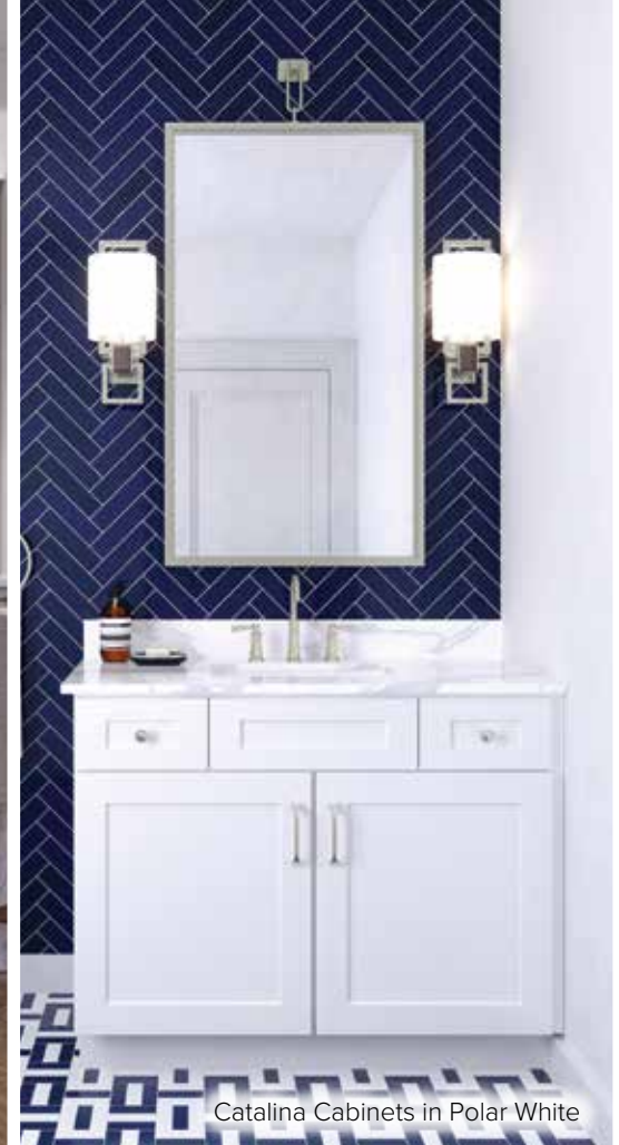
Catalina Cabinets in Polar White