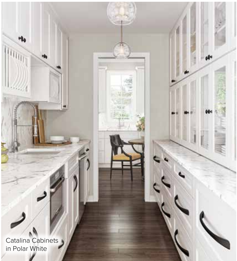
Catalina Cabinets in Polar White