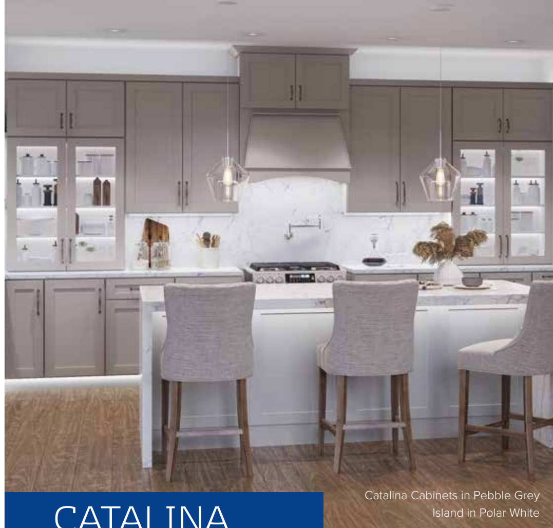
Catalina Cabinets in Pebble Grey Island in Polar White