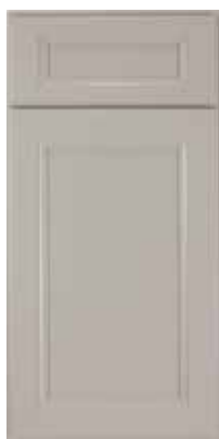
Pebble Grey (Painted)