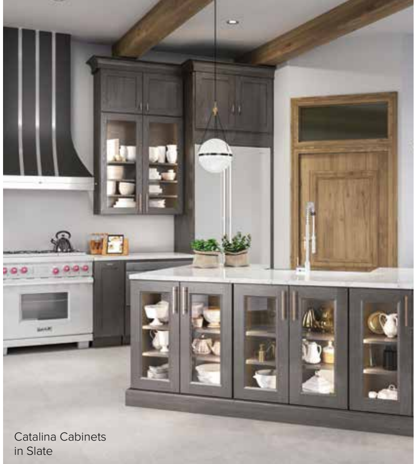
Catalina Cabinets in Slate