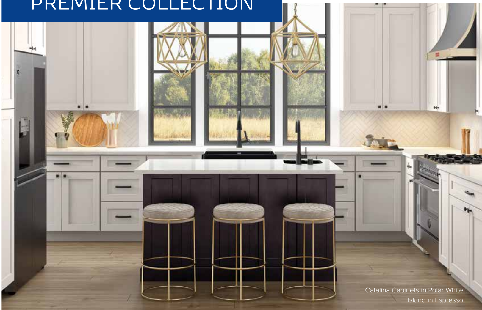
Catalina Cabinets in Polar White Island in Espresso

The Premier Collection features elegant upgrades like soft-close doors and drawers that won't slam when closed.