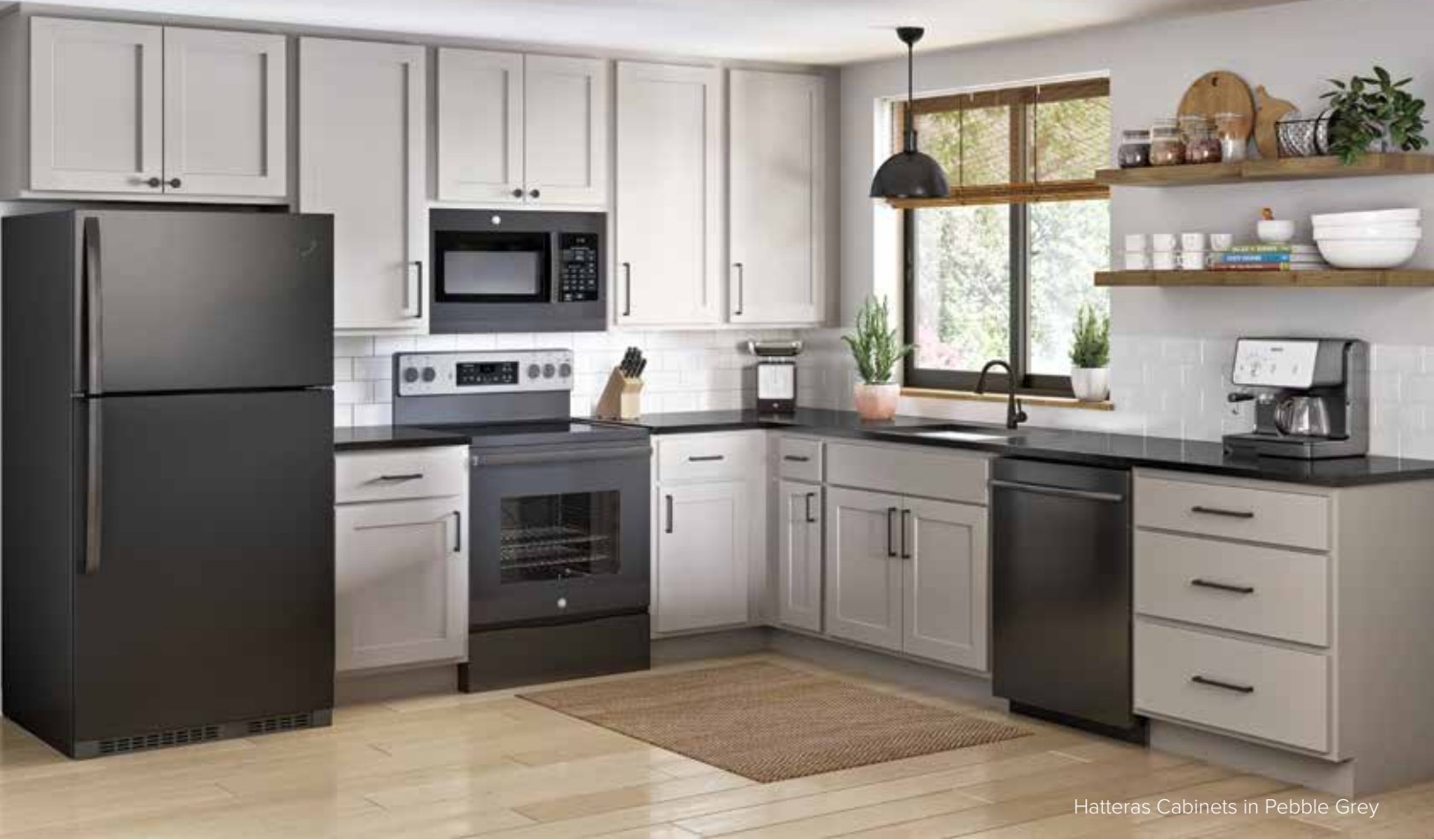
Hatteras Cabinets in Pebble Grey

The Essentials Collection features reliable hardware and sturdy construction that create a quality cabinet at a great value.