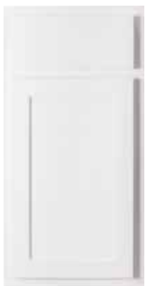
Polar White (Painted)